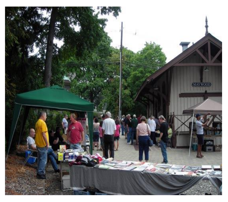
The Annual Railroad Day at Maywood Station was held on August 10, 2008. Local model railroad clubs and railroad historical societies were on hand and model railroad manufacturers showed their latest offerings.