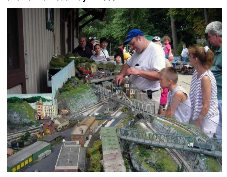
One of the highlights each year at the Annual Railroad Day at Maywood Station is the N-scale modular layout by N-Trak of Northern New Jersey. Young and old alike marvel at the realistic work on this fantastic layout set up for the August 10, 2008 event.

The Maywood Station Museum thanks the above organizations for their participation and for helping make the event such a success. We look forward to hosting another Railroad Day in 2009.