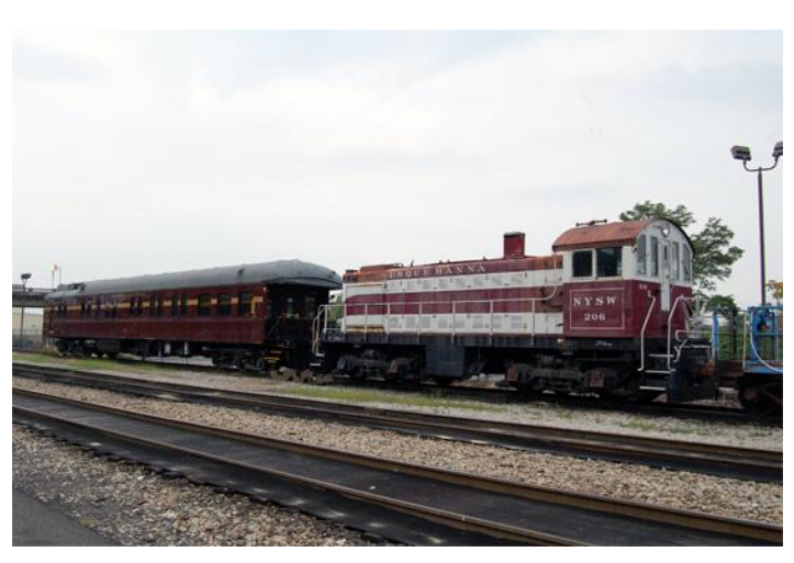
NYS&W #206 is seen back on home rails coupled to an NYS&W private car at their Ridgefield Park, NJ locomotive servicing facility on July 27, 2008.