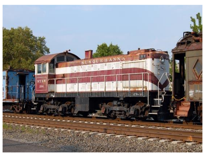
NYS&W #206 is seen being moved from the PSE&G storage yard in Ridgefield Park, NJ on CSX tracks to the NYS&W on July 26, 2008. The NYS&W will hold the locomotive until it is moved into Maywood Station.

On Saturday, July 26, 2008, NYS&W Alco S-2 #206 began its journey out of the United Railway Historical Society's (URHS) storage location at the PSE&G yard in Ridgefield Park, NJ. The #206 was part of a nine piece equipment move that included historic locomotives, cabooses and passenger cars that were destined to another URHS location in Boonton, NJ. The move started at approximately 4pm when a CSX crew began moving the equipment for it short but slow trip to the NYS&W at Ridgefield Park, NJ. By 6pm the consist had safely arrived onto the NYS&W. The next morning an NYS&W crew removed #206 from the consist and the remainder continued on its journey to Boonton, NJ on New Jersey Transit, arriving there later in the day. The NYS&W will hold the #206 temporarily while its condition is evaluated. It is anticipated that it will move to Maywood Station shortly where a restoration project will commence by MSHC members.