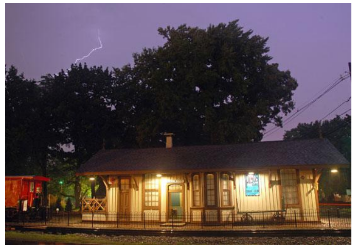
A wicked thunderstorm occurred during the July 23, 2008 MSHC work session. MSHC member Rob Pisani took this dramatic time-exposure night photo of a lightning bolt shooting from the sky over Maywood Station.