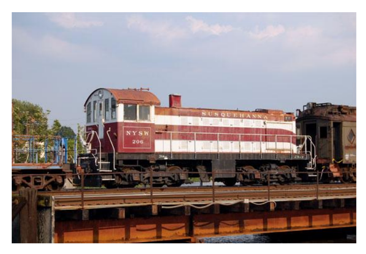
NYS&W #206 is seen being moved on CSX tracks across the bridge at Overpeck Creek in Ridgefield Park, NJ as part of the URHS equipment move from the PSE&G storage yard. July 26, 2008.