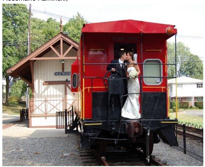
Maywood Station has become a popular location for wedding photos. Under sunny skies on July 19, 2008, a newlywed couple is seen posing for photos on the back of Caboose #24542. As Maywood Station is private property, permission for any photo shoots must be obtained in advance from the Maywood Station Historical Committee.