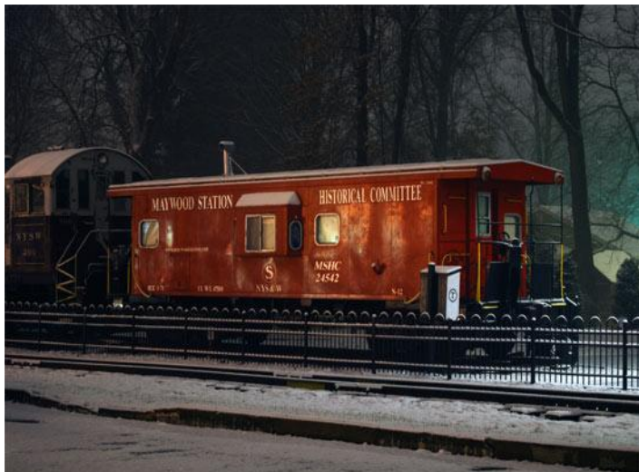
Maywood Station Caboose 24542 is seen during the first snowfall of the winter in this time-exposure night photo taken on December 16, 2008.