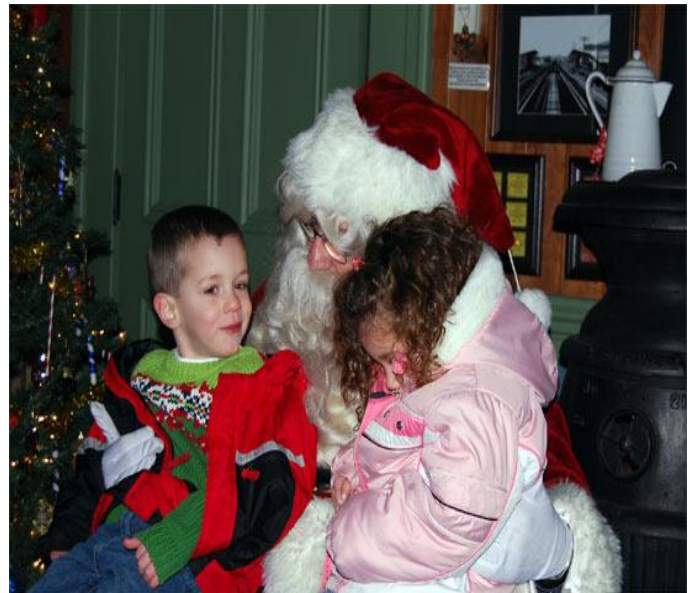
A happy brother and sister sit with Santa and tell them their holiday wish lists at the 7th Annual Santa at Maywood Station on December 20, 2008.