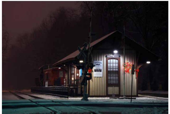
Maywood Station is seen decorated for the holidays in this time-exposure night photo taken on December 16, 2008.