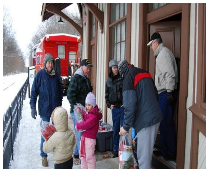
While Santa was meeting children inside the station at the 7th Annual Santa at Maywood Station on December 20, 2008, he was receiving help outside the station in the freezing temperatures from MSHC members who (left) handled crowd flow and handed out entry forms for the free raffles at the entrance door and (above) handed out the "goody bags" at the exit door. A coordinated effort by MSHC members assured a shorter wait outside to meet Santa and more time for each child to spend with Santa.