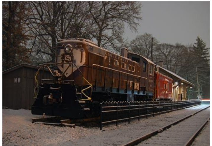
NYS&W #206 is seen during the first snowfall of the winter season in this time-exposure night photo taken on December 16, 2008. Restoration work on the locomotive will continue when warmer comes weather this spring.