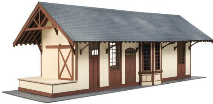
The Atlas Model Railroad Company Maywood Station™ O-Scale Laser-Cut Model Kit