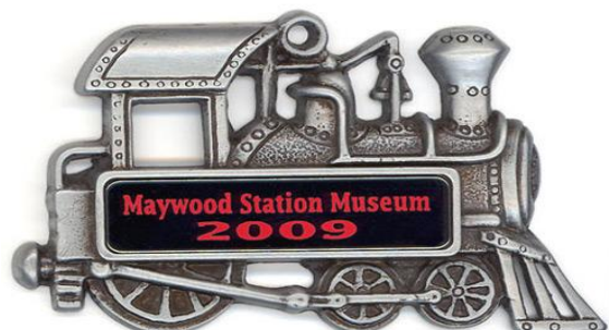
The 2009 Maywood Station Holiday Ornament