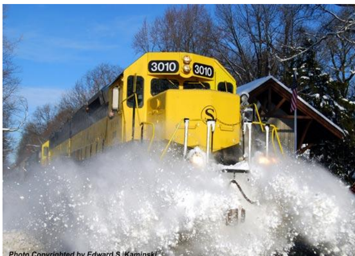
NYS&W SD40T-2 #3010 plows through a snow bank with gusto as it crosses Maywood Avenue leading eastbound road freight SU-100 on February 11, 2010, a day after a heavy snowfall pummeled northern New Jersey.

Please note – other special events may be added to the above Museum Operating Schedule. Please check our website at www.maywoodstation.com for any changes.