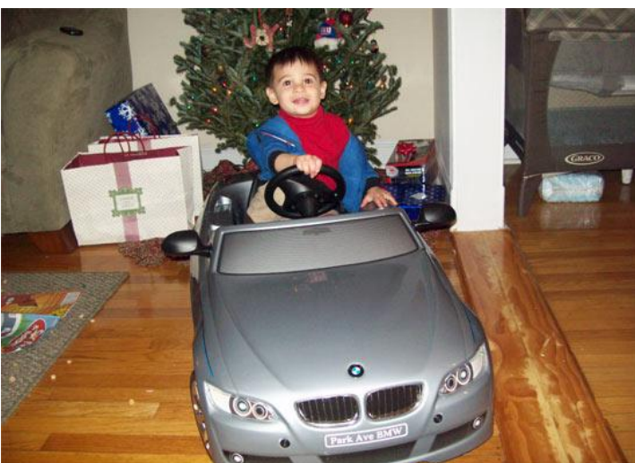
The free raffle winner of the BMW Z-6 Pedal Car courtesy of Park Ave BMW at the 8th Annual Santa at Maywood Station on December 19, 2009 takes a spin in his new ride.