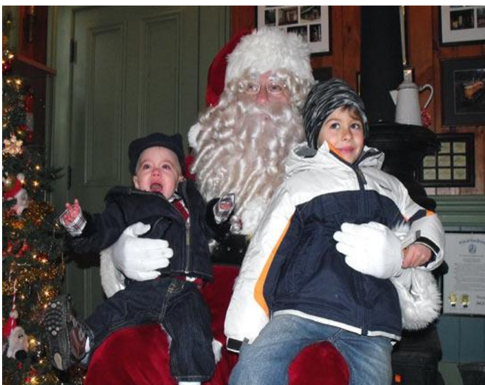
Two brothers pose on Santa's lap for a photo at the 8th Annual Santa at Maywood Station event on December 19, 2009.