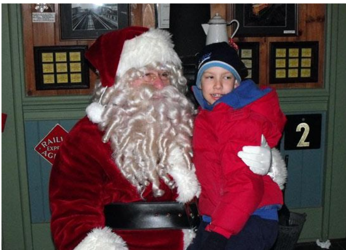
The 8th Annual Santa at Maywood Station event was held on December 19, 2009. Here a youngster discusses his wish list with Santa.