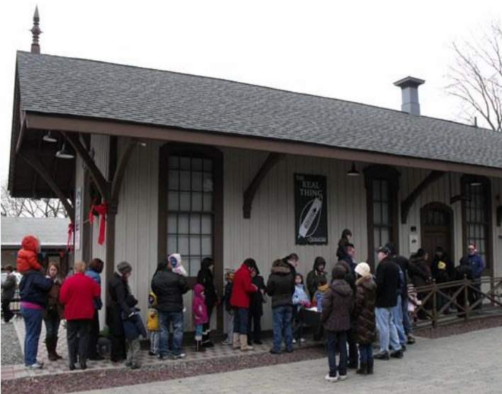
Similar to previous years when Santa visited, the 8th Annual Santa at Maywood Station on December 19, 2009 was very well attended by children and adults alike. The line of children and adults waiting to meet Santa stretched around the station several times.