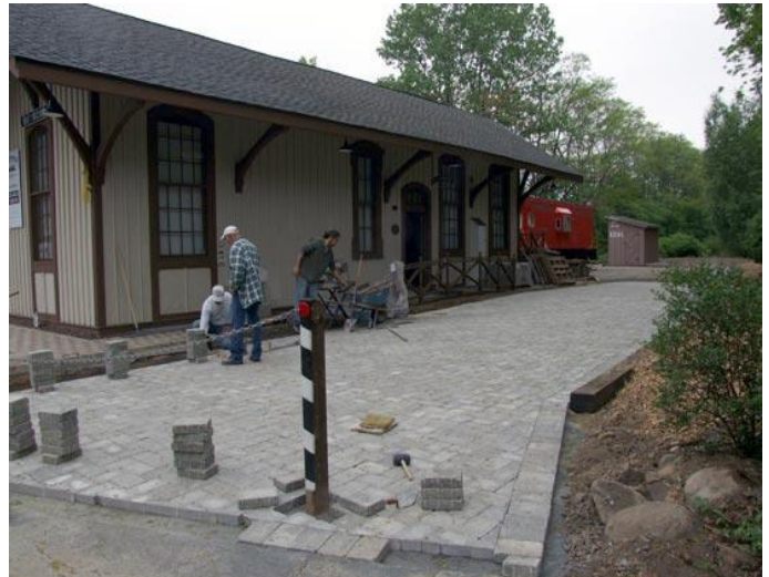
This perspective along the north side of Maywood Station on May 11, 2006 shows the scope of the Brussels Blocks project. Another phase extending the blocks behind the station was completed in late June.