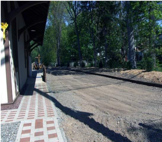
Grading and leveling of the north side of Maywood Station continued through April 2006. This April 30, 2006 view shows the area completed and ready for installation of Brussels Blocks including a railroad tie border along the length of the new berm.