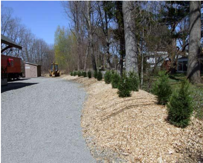
An April 2, 2006 view of the newly completed berm with Cyprus tree plantings.

In March, a crew from George Haag Construction Co. cleaned up the area and removed old telephone poles that were previously used as a boundary along the north side of the station property. On April 2, 2006, the crew completed building a 110-foot berm and planted Cyprus trees throughout it. The new border enhances the overall look of the station grounds and will provide privacy for the station's neighbors. By the end of April, grading and leveling of the grounds was completed and ready for installation of Brussels Blocks as well as a railroad tie border was installed along the length of the berm.