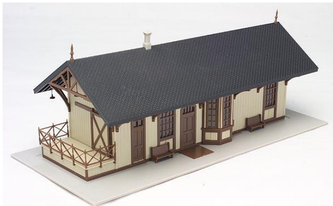
A view of the H.O (1/87 th ) Scale model of Maywood Station, which was released in late March 2006 by Atlas Model Railroad Company. The model is available in 3 paint schemes.