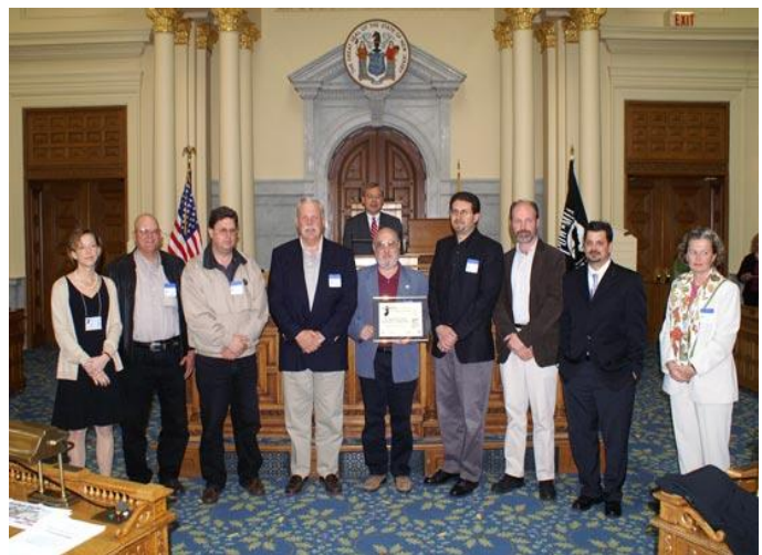
On April 29, 2006, at the NJ State House's State of New Jersey General Assembly Chamber in Trenton, NJ, the MSHC was presented with the 2006 State of New Jersey Historic Preservation Award. At the event, Individual Historic Preservation Awards were also presented to each member of the MSHC.

The members of the MSHC are truly honored to have been awarded this great distinction and thank the SHPO and NJHSC for their gracious hospitality at the award ceremony.