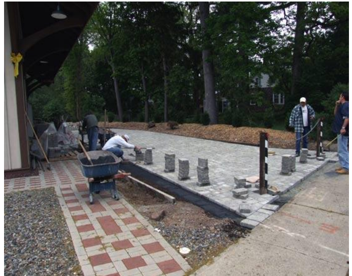
A May 11, 2006 view of A. Lepore & Grandson Masonry workers installing the new Brussels Blocks at the driveway side of Maywood Station. The station is now 100% handicap accessible inside and out.