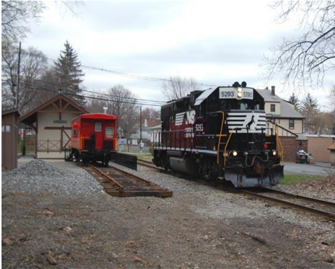
Norfolk Southern GP38-2 #5293 passes Maywood Station and Caboose #24542 heading west on April 6, 2008. Since late 2007, the New York, Susquehanna & Western has been leasing various Norfolk Southern, CSX and ex-Conrail GP38-2 locomotives as replacements for some of their older 4-axle locomotives, which they have retired.

The Maywood Station Museum will host its Annual Railroad Day at Maywood Station on Sunday, August 10, 2008 from Noon to 3pm. The Open House will feature operating model displays and vendor tables from local railroad historical societies, model railroad clubs and model manufacturers. Mark your calendar! This is usually one of our biggest events of the year.