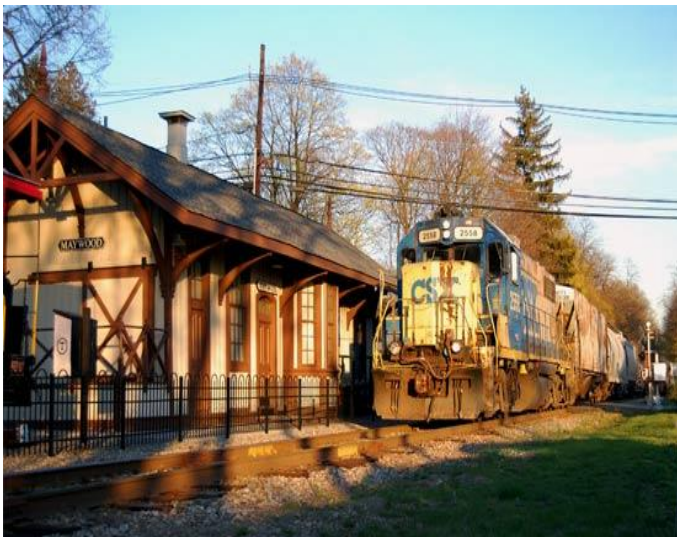
Leased CSX GP38-2 #2558 passes Maywood Station heading west with local freight WS-6 on April 16, 2008.