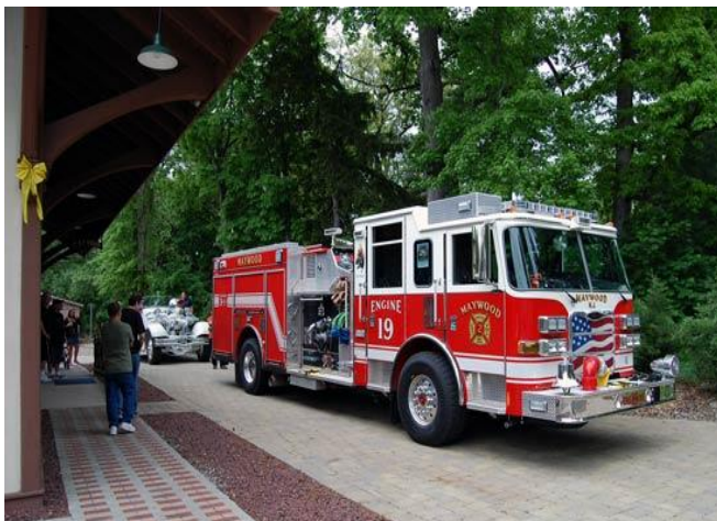
Maywood Fire Department Day at Maywood Station was held on May 18, 2008. The Maywood Station Museum Open House featured an outdoor fire truck display courtesy of the Maywood Fire Department including their brand-new Fire Engine #19.

The museum exhibit of fire department memorabilia will also be shown at the Sunday, June 22 Maywood Station Museum Open House from Noon to 3pm. The Maywood Fire Department will also host their official "wet down" of new Fire Engine #19 the day before on Saturday, June 21 around the block from the museum at the Peerless Company Firehouse on West Hunter Avenue from 3pm to 7pm.