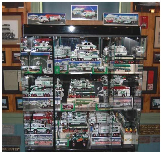
A view of the Hess Toy Truck Exhibit that was shown at the April 6, 2008 Maywood Station Museum Open House.

The exhibit was very well received and generated a lot of interest among attendees. An encore exhibit of the toy trucks may be shown on a later Maywood Station Museum Open House date, possibly next year.