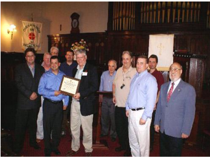
Members of the MSHC are shown receiving the 2009 Historical Preservation Commendation Award from the County of Bergen, New Jersey Historic Preservation Advisory Board in the Category of Preservation Education for producing the Documentary DVD, The Maywood Station Story at Historic Church on the Green in Hackensack, NJ on May 7, 2009.