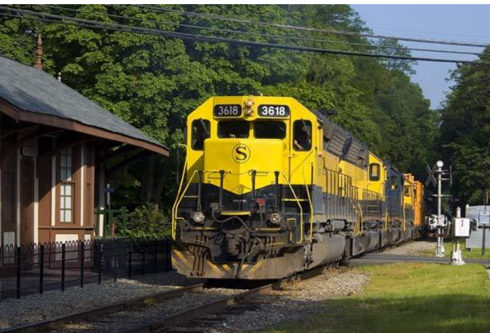
NYS&W SD45 #3618 leads westbound road freight SU-99 past Maywood Station on a sunny May 24, 2009 evening.

The Maywood Station Museum will also be open and visitors are invited to tour the station and see its many displays, photographs and artifacts and climb aboard Caboose 24542 with its operating model train layout. In the event of inclement weather, the rain date for the Annual Railroad Day at Maywood Station will be Sunday, August 23, 2009 from Noon to 3pm.