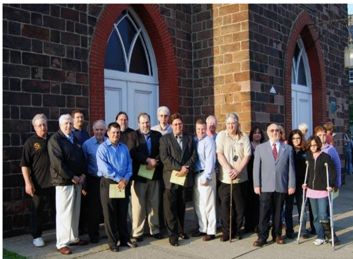
Members of the MSHC are shown gathered in front of Historic Church on the Green on May 7, 2009 before receiving the 2009 Historical Preservation Commendation Award from the County of Bergen, New Jersey Historic Preservation Advisory Board in the category of Preservation Education.

On May 7, 2009, the County of Bergen, New Jersey Historic Preservation Advisory Board presented the Maywood Station Historical Committee with the 2009 Historic Preservation Award in the category of Preservation Education at an Awards Program and Reception at Historic Church on the Green in Hackensack, New Jersey. The Award was given in recognition of the MSHC's work in assembling, producing and releasing their acclaimed recently-released Documentary DVD, The Maywood Station Story . The MSHC now has the distinction of being four-time recipients of County of Bergen, New Jersey Historic Preservation Awards. The MSHC previously received an award in the category of Restoration and Preservation in 2004 for their work to restore and revitalize Maywood Station; in the category of Historic Leadership in 2005 for their continued work in creating historic awareness in Maywood Station; and in the category of Education in 2008 for the numerous museum offerings that available to local organizations and the general public. The 2009 Historic Preservation Award marks the 23rd proclamation, resolution or award the MSHC has received in the past seven years since the all-volunteer, 501(C)3 organization was founded and began the restoration of Maywood Station.