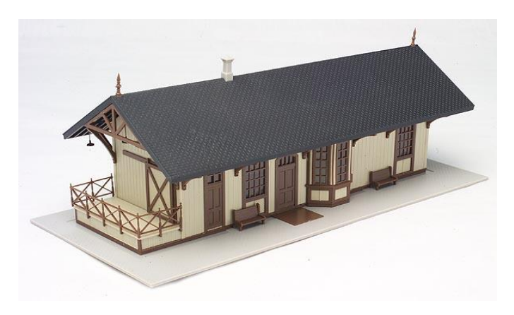
A view of the H.O (1/87<sup>th</sup>) scale model of Maywood Station. The model is also offered in N (1/160<sup>th</sup>) scale and is available in 3 different paint schemes originally found on Maywood Station.