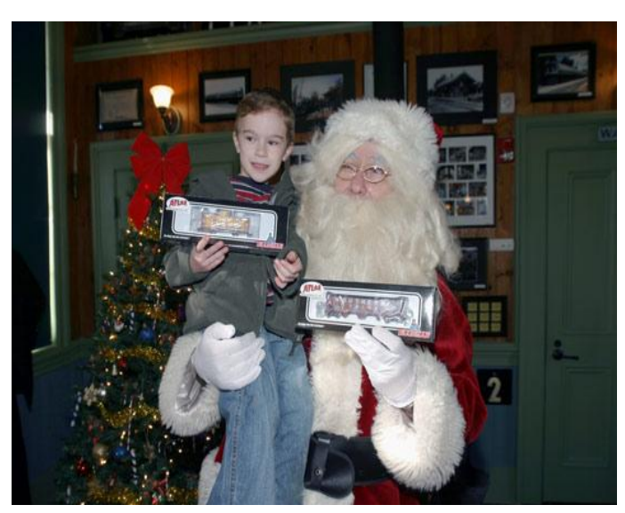
The happy winner of the free raffle for the Atlas Model Railroad Company H.O. Scale Starter Train Set is shown holding some of the models from the set with Santa at the "5<sup>th</sup> Annual Santa at Maywood Station" on December 16, 2006.