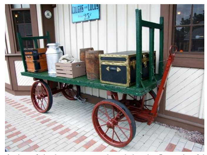
A view of the baggage cart taken during the September 24, 2006 Museum Open House. The baggage cart adds another item of authenticity to the Maywood Station restoration.

From the late 1800's through the 1970's, baggage carts were common at almost every railroad station that served long distant passengers or handled freight and Maywood Station was no exception. The MSHC is pleased to have been able to add this significant artifact to the Maywood Station restoration project and museum.