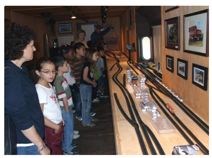
On October 19, 2006, all five 2nd grade classes from Memorial School in Maywood individually visited the Maywood Station Museum for a class trip. In the above photo, one of the classes is shown touring the inside of Caboose 24542.

A view of the recently released 2006 Mavwood Station Holiday Ornament. The ornament and previous year's releases will be available at the Maywood Station Museum on 2007 Open House dates as well as by mail order on the MSHC website.