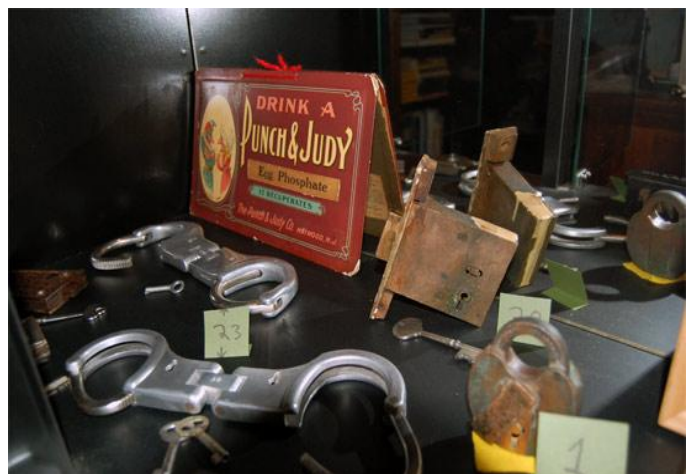
Some examples of the antique locks and locking devices that were on exhibit at the November 9, 2008 Maywood Station Museum Open House.