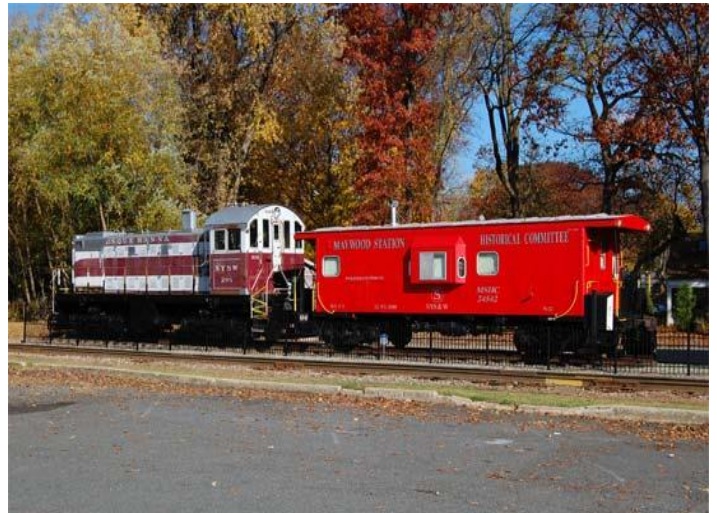
NYS&W #206 and Maywood Station Caboose 24542 are seen on November 9, 2008.