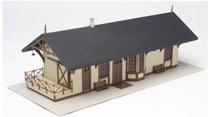
A view of the H.O (1/87 th ) scale model of Maywood Station. The model is also offered in N (1/160 th ) scale and is available in 3 different paint schemes originally found on Maywood Station.

Atlas Model Railroad Company H.O. (1/87th) scale and N (1/160th) scale models of Maywood Station are now available. The models accurately depict the station and include the brick pathway, benches and fencing. They are available in 3 different paint schemes that were originally found on the station – tan/brown; gray/maroon; and pale green/dark green. The model is available for purchase at the Maywood Station Museum on 2008 Open House dates and seven days a week at Maywood Hardware, 39 West Pleasant Avenue, Maywood, NJ. Built-up versions of the H.O. scale models are priced at $38.00 each and kit versions are priced at $22.00 each. Built-up versions of the N-scale models are priced at $28.00 each and kit versions are priced at $18.00 each. More information and online ordering can also be found on the MSHC website at http://www.maywoodstation.com/ .