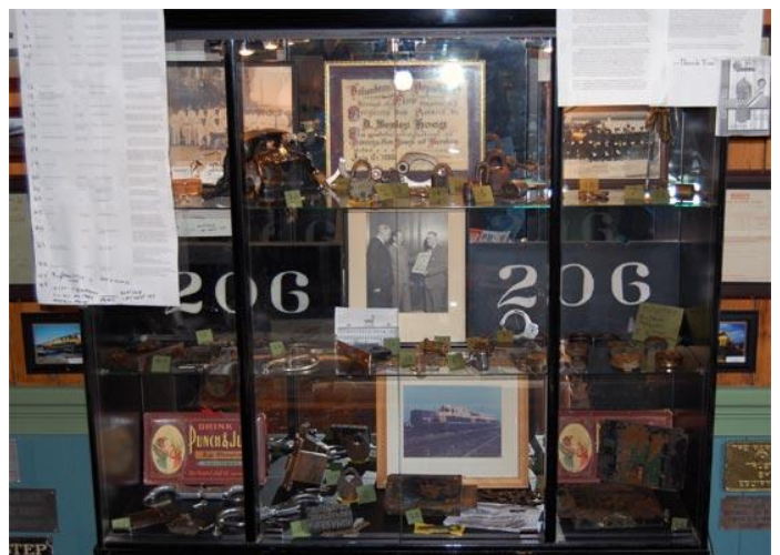
An exhibit of antique locks and locking devices courtesy of MSHC member Vincent Molodowec was shown at the November 9, 2008 Maywood Station Museum Open House.

The Maywood Station Museum Open House on November 9, 2008 featured an exhibit of antique locks and locking devices courtesy of Maywood Station Historical Committee member Vincent Molodowec. In addition to the special exhibit - artifacts, photographs and items of historical significance were on display in the Maywood Station Museum and Caboose #24542 was open featuring its operating model train layout.