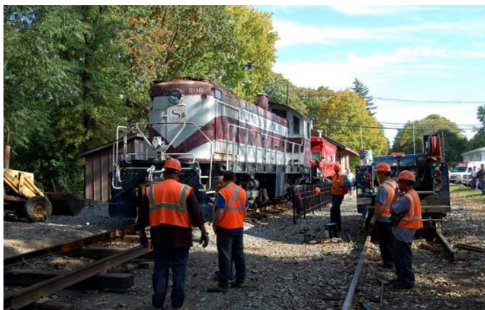
The New York, Susquehanna & Western Railway track crew checks NYS&W #206 after being moved into Maywood Station on October 14, 2008.