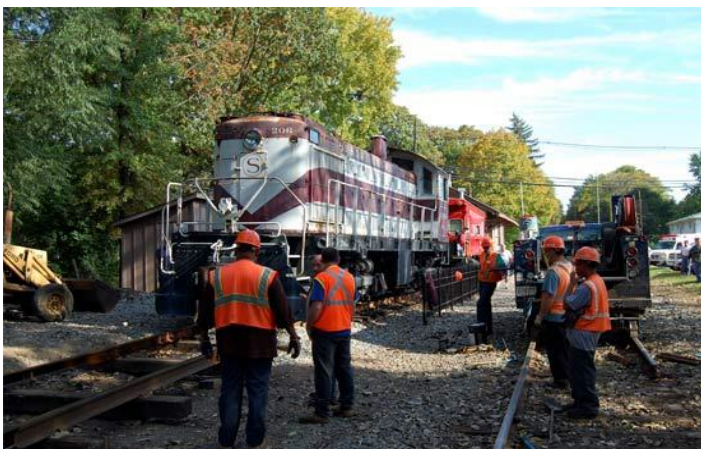
The New York, Susquehanna & Western Railway track crew checks NYS&W #206 after being moved into Maywood Station on October 14, 2008.