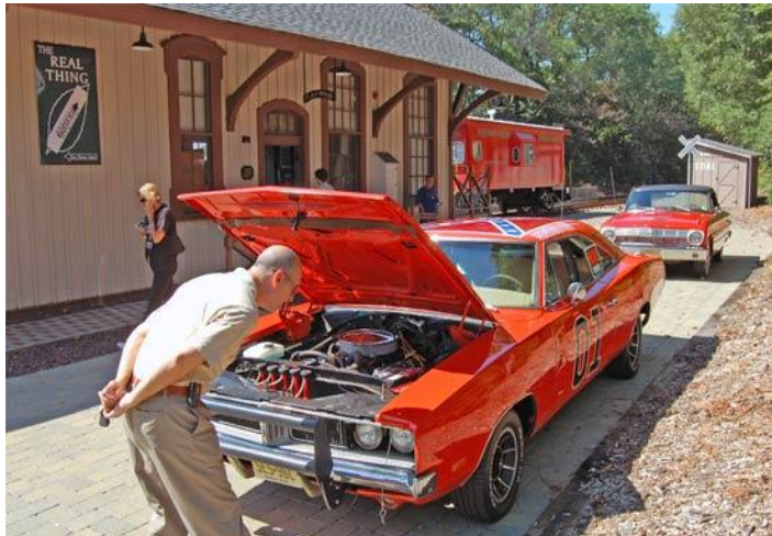
Visitors got the opportunity to inspect and look under the hood of a General Lee Dodge Charger from the 1970's television series The Dukes of Hazard at the September 21, 2008 Maywood Station Museum Open House.

A General Lee Dodge Charger from the 1970's television series The Dukes of Hazard plus additional classic cars were on display on the station grounds at the Maywood Station Museum Open House on September 21, 2008. Inside Maywood Station, a special exhibit courtesy of Douglas Dezso featuring Promotional Model Cars was shown. The plastic model cars were specifically made as promotional items for car dealerships in the 1950's to early 1990's period to give out to potential customers who were contemplating buying one of the actual cars. They came painted with the exact color that the real car was offered in and all the specifications were embossed on the bottom. Some had friction motors, others even came as banks. These were highly collectible by executives and car buffs of those eras. The heyday of these model cars was the 1960's. Today they are very rare and highly collectible, especially those in their original boxes.